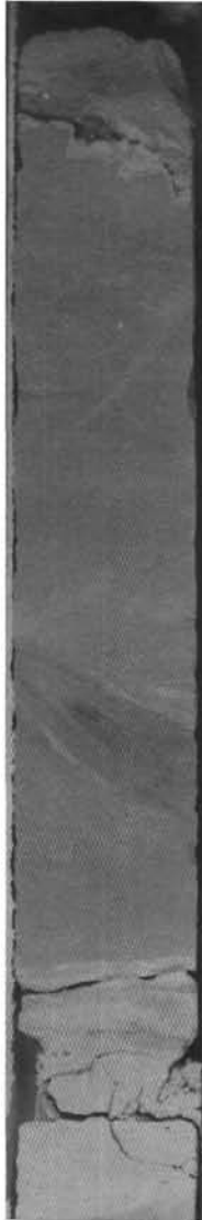
538A-21-1, 2–40 cm

Wavy lamination and ripple cross lamination, probably formed by bottom currents in pelleted mud; middle Cretaceous (Albian or Cenomanian).