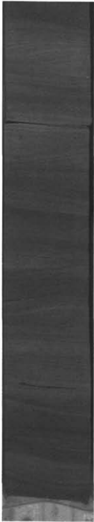
535-34-2, 114–150 cm

Wavy lamination and ripple cross lamination, probably formed by bottom currents in pelleted mud; middle Cretaceous (Albian or Cenomanian).