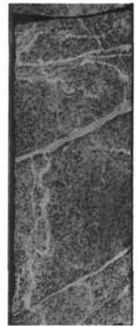
538A-33-1, 56–72 cm

"Transitional" crust consisting of Paleozoic gneiss (top photo); dissected by Early Jurassic diabase (bottom photo).