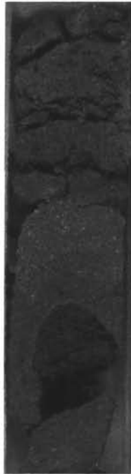
537-13-1, 1–24 cm

Reddish Paleocene chalk (a slump) overlying light-colored Eocene sediments; slumping in this condensed sequence attributed to tectonic movements of fault block.