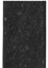
538A-30-1, 125–135 cm