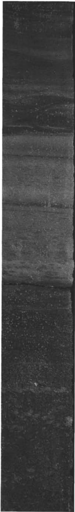
SITE 467, CORE 79, SECTION 2, 60–100 cm