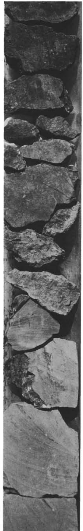
SITE 471, CORE 79, SECTION 1, 70–110 cm