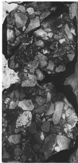
SITE 469, CORE 33, SECTION 1, 94–106 cm