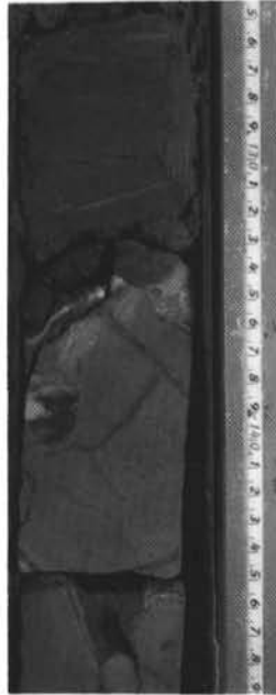
CRETACEOUS CLAY OVERLYING BASALT FROM WHARTON BASIN (SITE 257, CORE 10)