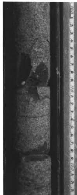
FRESHER BASALT FROM 58M BELOW THE SEDIMENT BASALT INTERFACE FROM WHARTON BASIN (SITE 257, CORE 17)